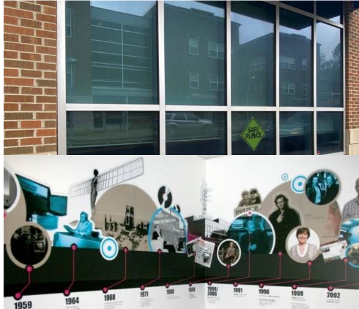
Visual History Lesson