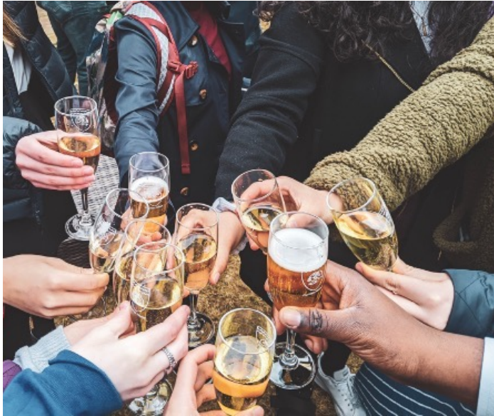
Commemorative Beverage & Fundraiser